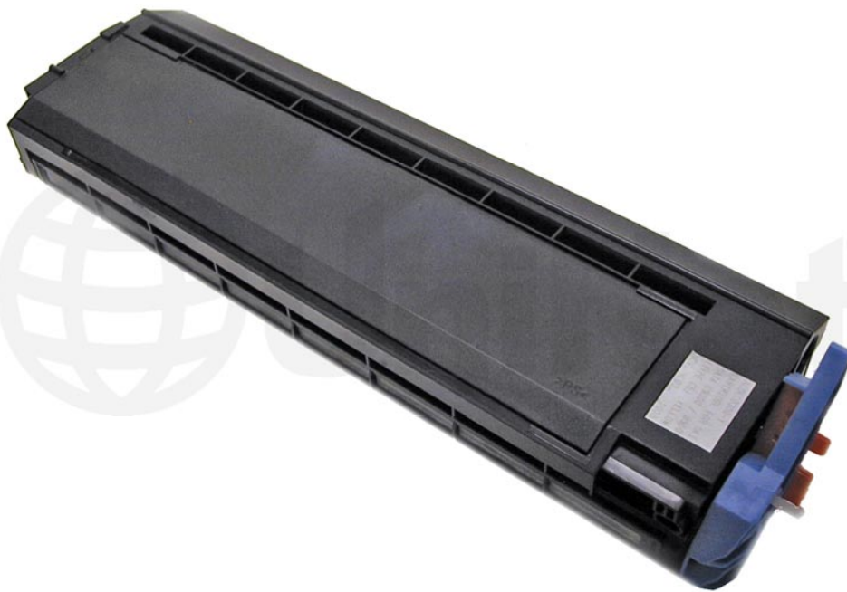
OKIDATA C9300 SERIES TONER CARTRIDGE